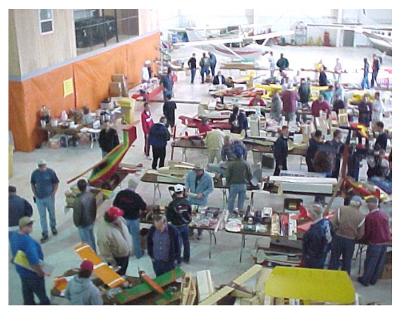
Annual Swap Meet on Saturday of Thanksgiving weekend. For more details go to www.madisoncorc.com