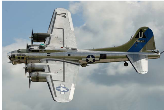
File photo of B-17G "Sentimental Journey"

A rare sight. While working in the yard last Sunday I heard a faint rumble. Thought was just a bunch of Harleys coming down the road. But it wasn't coming from the direction of any road. As the roar got louder I looked around and didn't see anything. Then as roar got closer it wasn't the sound of Harleys but non other than sound of four radial engines. I looked up and sure enough flying low and slow was a B-17. What a magnificent sight. All polished aluminum from the tail insignia it appeared to be the "Sentimental Journey" didn't have time to grab the camera. Hope maybe some of the guys from Elwood saw it too.